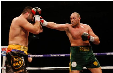
Tyson Fury fighting Christian Hammer

Tyson Fury kept alive his hopes of a WBO world heavyweight title fight with Wladimir Klitschko later on this year with a conclusive victory over Christian Hammer at the O2 Arena in London on 28 th February, after the German-based Romanian retired after eight rounds.